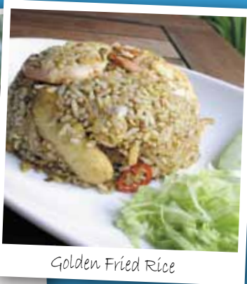
Golden Fried Rice