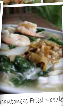
Cantonese Fried Noodle