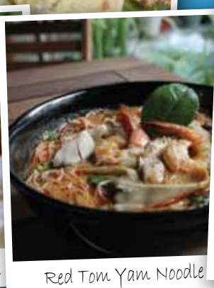
Red Tom Yam Noodle