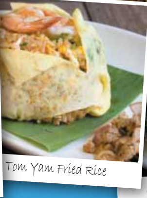
Tom Yam Fried Rice