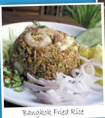
Bangkok Fried Rice